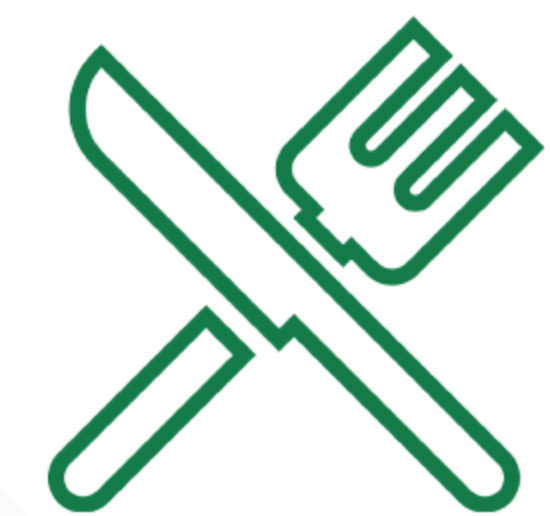
Canteen / Cafeterias