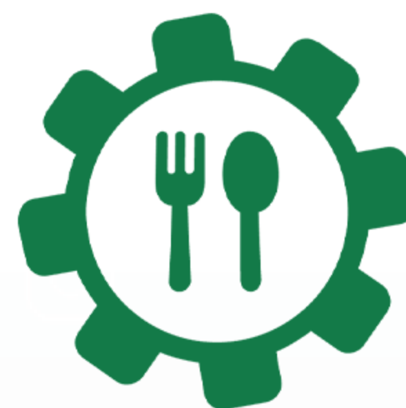
Food Processing Sites