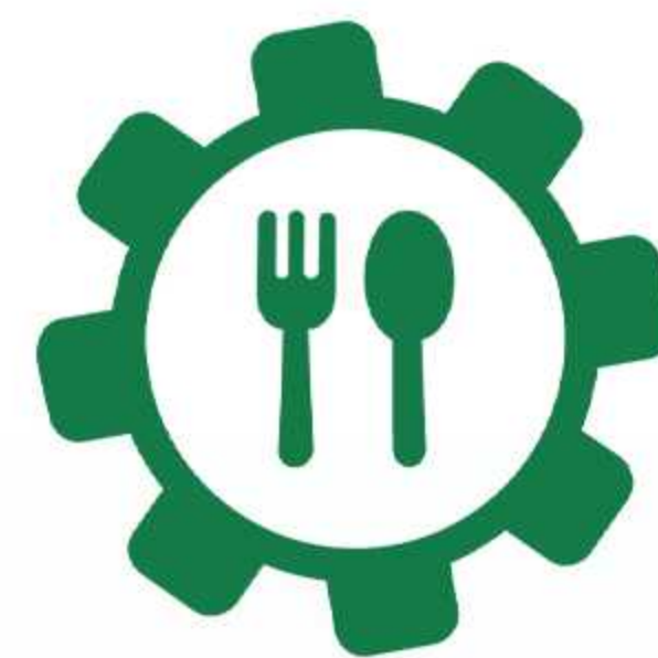
Food Processing Sites