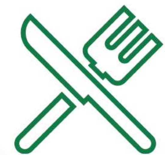
Canteen / Cafeterias